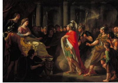
Aeneas and Dido in Aeneid IV

The pupils will continue their study of the Latin language, consolidating and building on the knowledge they gained at GCSE and translating increasingly complex passages with fluency. Although they will not take the AS Level examination, they will learn the AS Level defined vocabulary list: there is no defined list for A Level. Instead, we will support pupils to expand their knowledge of vocabulary through further reading and additional vocabulary lists. Pupils will study texts written by a range of prose authors (including the prose unseen author Livy) and the verse unseen author (Ovid) to develop their linguistic competence. They will sit two language examinations at the end of the course: Unseen Translation (1 hour 45 minutes) and Prose Composition or Comprehension (1 hour 15 minutes).